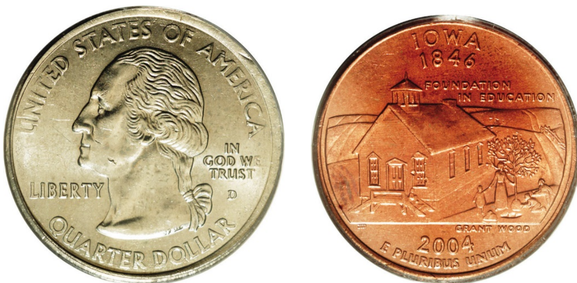
2004-D Iowa statehood quarter missing the entire reverse clad layer. Copper core fully exposed.