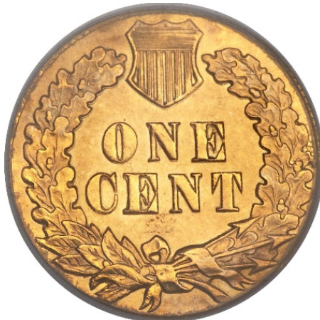
1900 Indian Head cent struck on a $2½ gold quarter eagle planchet.