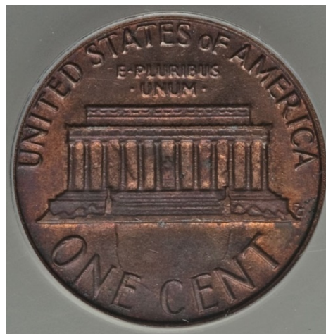
1985 Lincoln cent with clashed dies—an error nicknamed a “Prisoner Penny” as it appears Lincoln is behind bars! These raised lines surrounding Lincoln are from the spaces between the columns of the Lincoln Memorial design seen on the reverse. They were transferred to the obverse die from the reverse die when they smacked together without a planchet in between them.