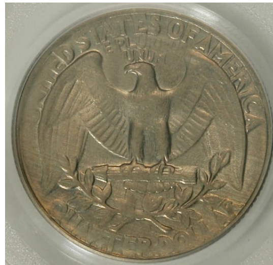
1970-D Washington quarter struck on a planchet the thickness of a dime. (Not struck on a dime planchet, but on copper-nickel stock that was rolled out for dimes. The coin was not able to receive a full/strong strike due to the thinness of the planchet. Dimes are thinner than quarters.)