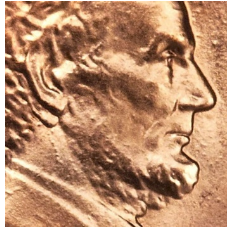
1984 Lincoln cent, doubled die obverse (notice the strong doubling below the ear and beard).