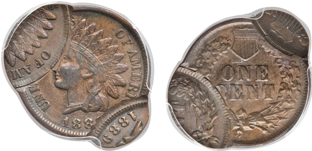
1889 Indian Head cent, triple struck.