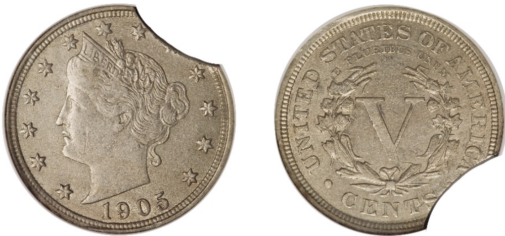
1905 Liberty Head nickel struck on a curved, clipped planchet.