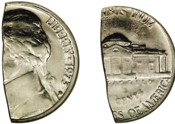
1973-D Jefferson nickel struck on a straight-clipped planchet. A straight clip like this is most likely from the end of a strip/sheet.