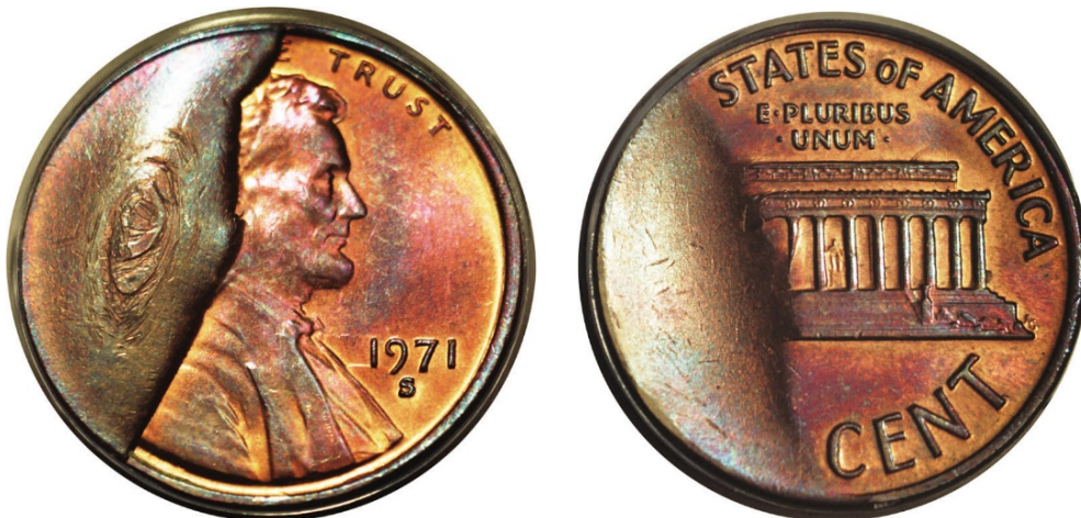
1971-S Lincoln cent with a major obverse die break. This huge cud was created by a piece of metal breaking off the obverse die face. (Notice the area on the reverse that couldn't be struck because of the void created by the missing portion of the obverse die.)