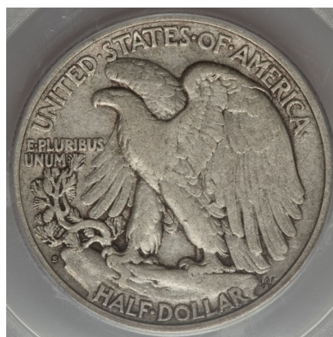
1921-S Walking Liberty half dollar, planchet lamination on obverse. Lamination errors are often the result of an improper mixture of coinage metals (reverse not affected).