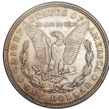
1921 Morgan silver dollar, obverse struck through grease or a filled die (reverse die unaffected).