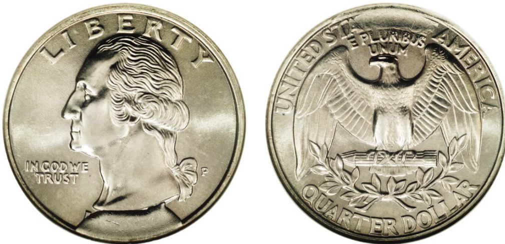
(19--)-P Washington quarter with an obverse die break where the date should be. This is a "cud." (Notice the affected area on the reverse that did not strike fully due to the obverse cud error.)