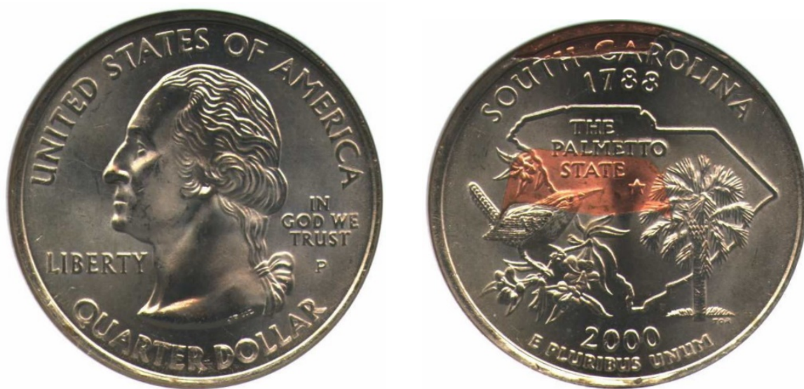
2000-P South Carolina statehood quarter reverse missing partial clad layer. Copper underneath is showing.