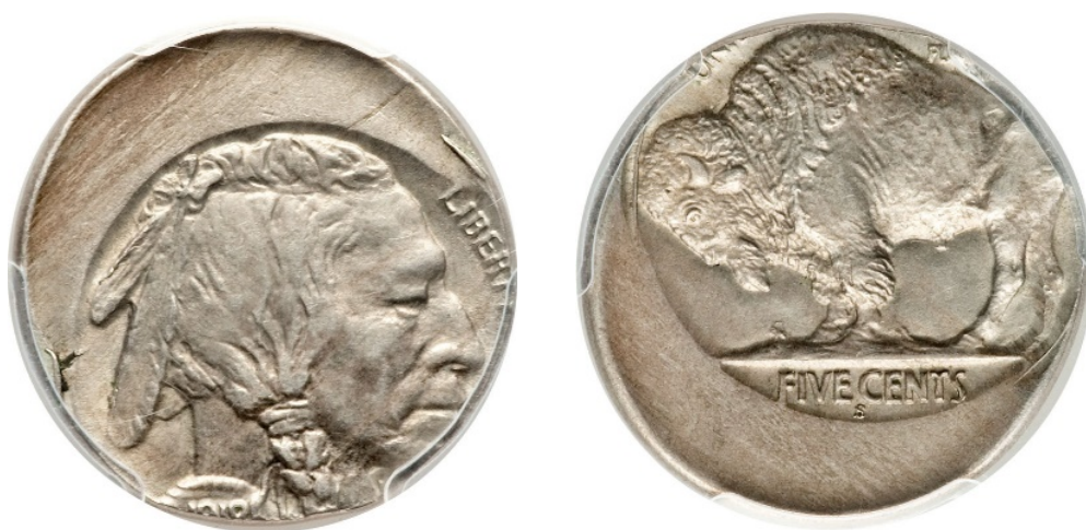
1918-S Indian Head/Buffalo nickel, struck about 25 percent off-center.

Eisenhower dollar blank (left) and Eisenhower dollar planchet (right). Notice that the blank is completely flat across the surface. The planchet has gone through the upsetting mill, as evidenced by the raised rim along the edge. Blanks are usually turned into planchets before they are struck.