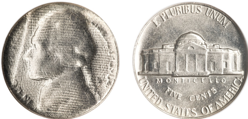
1964 Jefferson nickel obverse struck through cloth, producing a grid-like pattern.