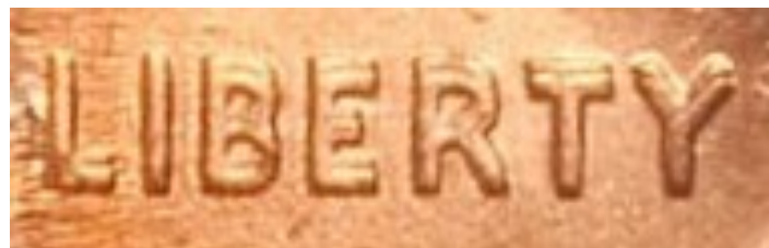
1995 Lincoln cent, doubled die obverse. This is a moderately doubled die, but still desired by many collectors. This is a great "first DDO" variety to search for.