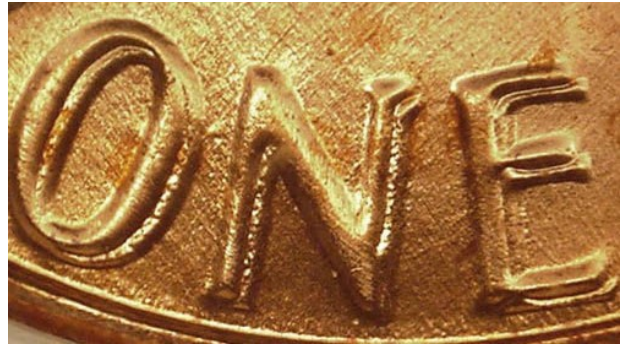
1983 Lincoln cent, doubled die reverse.