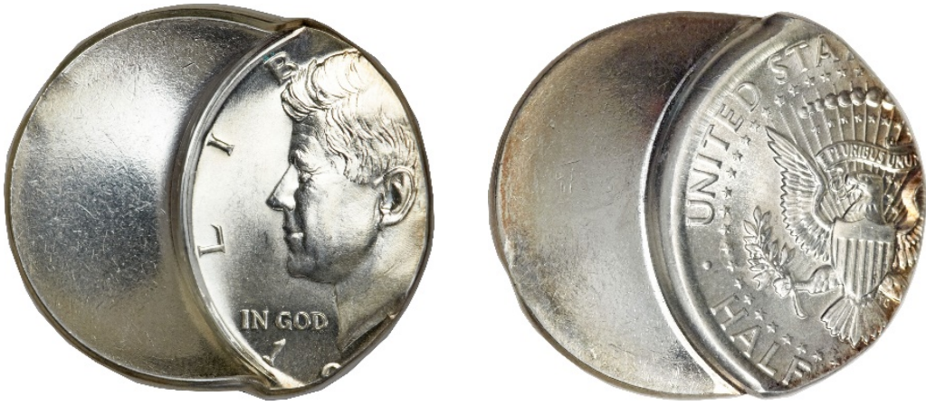
1964 Kennedy half dollar, struck about 50 percent off-center.