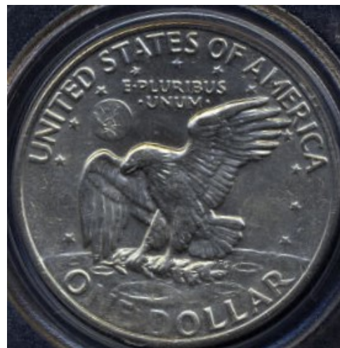
1972 Eisenhower dollar struck with partially filled-in dies. (Note: Circulated specimen but the lack of obverse details is due to a filled-in die as evidenced by the strength of the reverse design. The reverse die was also partially filled-in as evidenced by weakness on the "NE" and "D" in "ONE DOLLAR.")