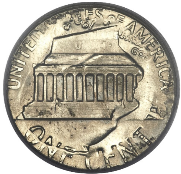
1981 Lincoln cent struck on a 1981-P Roosevelt dime. This is technically a double-denomination error, but it's much more fun to call it an 11-cent piece!