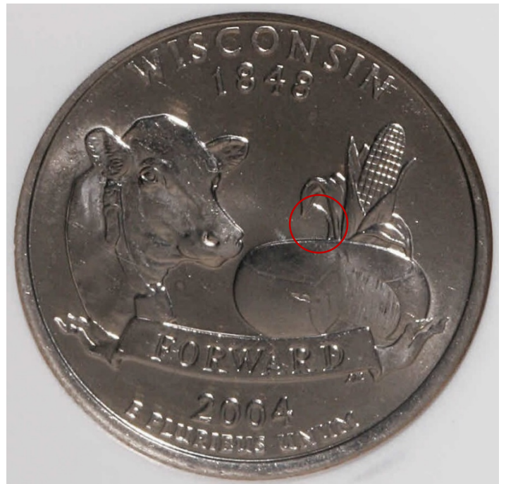
2004-D Wisconsin statehood quarters, normal reverse die (top), Extra Leaf-low (left), and Extra Leaf-high (right). Some Wisconsin quarters from the Denver Mint were struck with a strong die gouge on the reverse, under the left leaf on the ear of corn. This is a mysterious variety, as no one knows how or why this happened. Die gauges show up as raised marks on struck coins.