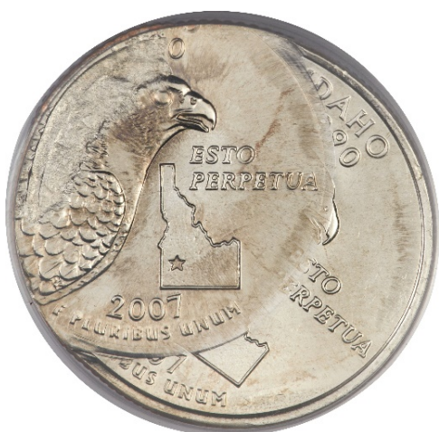
2007-D Idaho statehood quarter double-struck ( not a doubled die). The first strike was centered properly, but the accidental second strike was struck about 40 percent off-center.