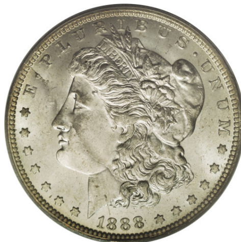
1994-P Jefferson nickel reverse and 1888-O "Scarfaced" Morgan silver dollar with sizable obverse die cracks.