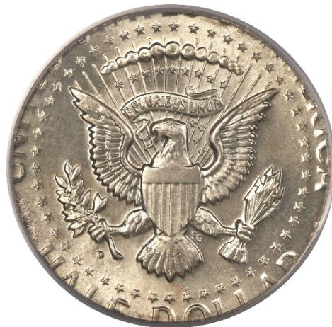
1964-D Kennedy half dollar struck on a quarter dollar planchet.