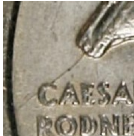
1999-P Delaware statehood quarter with a reverse die crack. (Enlarged image, right.)