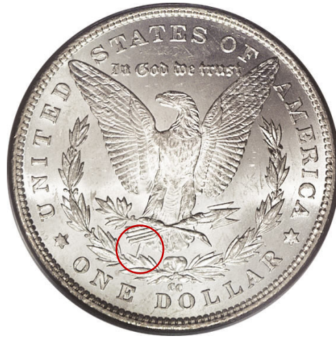
1890-CC Morgan silver dollar with a "tail bar" die gouge (right, normal reverse die left). Look under the arrow shafts for the thick line going down to the wreath, above the "E" in "ONE." A gauge on a die will show up as a raised mark on the coin struck from it.