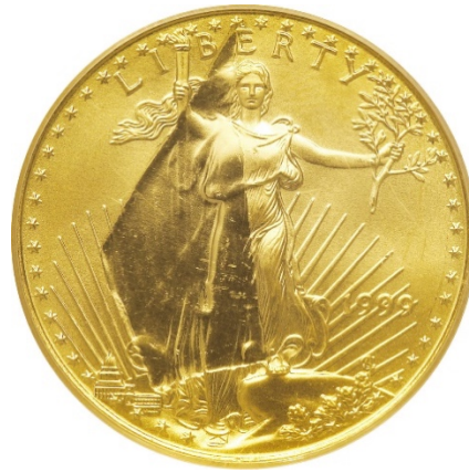
1966 Lincoln cent obverse struck through a staple that has been retained, and 1999 $25 American gold eagle obverse struck through a foreign object that was not retained.