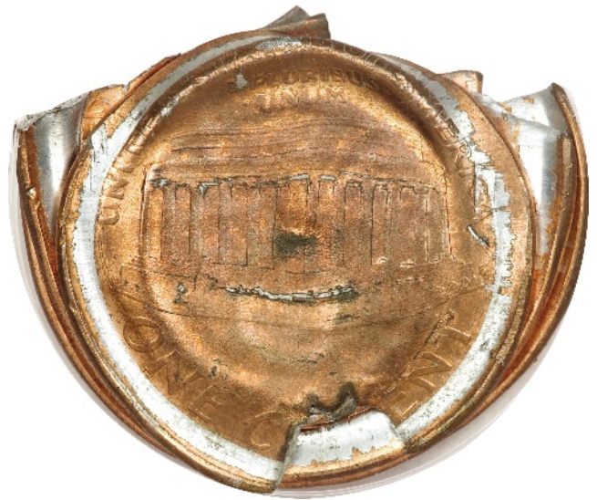
1999 Lincoln cent, three-piece bonded die cap. Three separate planchets became stuck in the coining chamber and were fused or bonded together due to the intense heat and pressure.