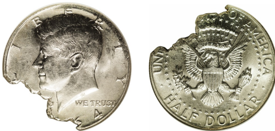
1964 Kennedy half dollar struck on a ragged-clipped planchet. A clip like this occurred due to the blank being punched out too close to the end of the sheet of metal.