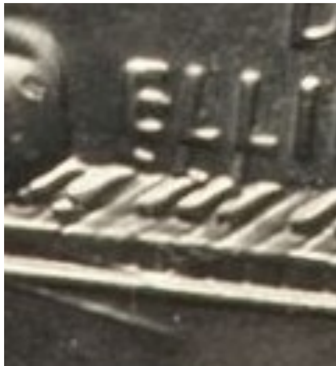
2009-D District of Columbia quarter, doubled die reverse. Look for strong doubling at the bottom of "ELL." This is an elusive variety that can pay off handsomely! Look near the central design features on other 21 st century coins for more doubled dies!