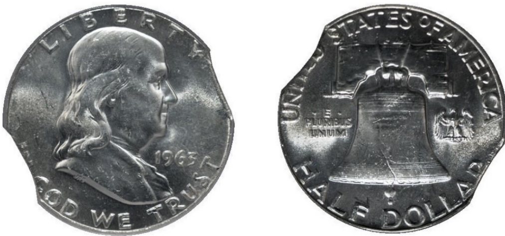
1963 Franklin half dollar struck on a double-curved, clipped planchet.