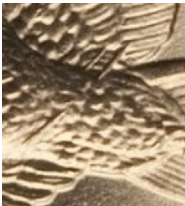
2000-P Sacagawea dollar, "Wounded Eagle" Reverse. Note the huge die gouge running through the eagle's belly. Some varieties earn clever nicknames; these "Wounded Eagles" can still be found in circulation.