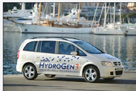
The PGE could play a crucial role in fuel cell technology, which could revolutionize clean energy production for cars, homes, and businesses. From http://www.platinum.matthey.com/about-pgm/image-gallery/ .

Most of the world's PGE are concentrated in magmatic ore deposits, which form during the cooling and crystallization of magma. If mafic to ultramafic magmas become saturated in sulfur, an immiscible sulfide liquid will separate from the silicate magma and form globules that naturally concentrate metals like copper, nickel, and PGE. As the magma cools, the PGE-enriched sulfide globules accumulate and crystallize to form PGE mineral deposits. Most magmatic copper-nickel-PGE deposits are found with volcanic and plutonic rocks that form where large volumes of mafic magma move from the Earth's mantle into the crust. Erosion of PGE-enriched rocks and physical concentrations of heavy mineral particles, by the action of moving water, can produce PGE-enriched placer deposits.