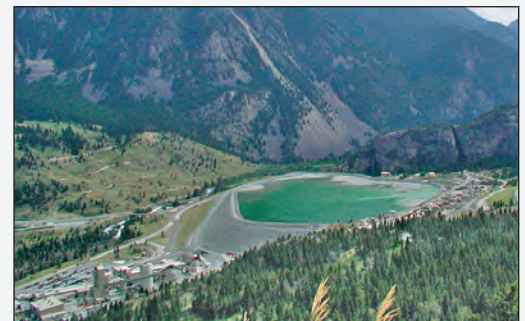
The world's highest grade PGE deposit occurs in the Stillwater Complex of Montana, where grades are as high as 23 grams per ton (g/t) PGE. In comparison, ore grades in the Bushveld Complex of South Africa typically range from 6 to 10 g/t PGE.

To help predict where PGE supplies might be located, USGS scientists study how and where PGE resources are concentrated in the Earth's crust and use that knowledge to assess the likelihood that undiscovered PGE deposits may exist. Techniques used for assessing mineral resources were developed by the USGS to support the stewardship of Federal lands and evaluate mineral resource availability in a global context. The USGS also compiles statistics and information on the worldwide supply, demand, and flow of PGE. These data are all used to inform U.S. national policymakers.