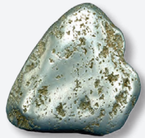
Platinum nugget weighing 0.444 kilograms from Sverdlovsk Oblast, Russia, in the Ural Mountains (catalog number NMNH 73736 00 from the Smithsonian National Museum of Natural History).

In the United States, the Stillwater Complex, a mafic-to-ultramafic igneous intrusion in Montana, has a deposit that has produced roughly 305 metric tons of platinum and palladium since 1986. Drilling estimates indicate another 2,200 metric tons are present. Mining has progressed to depths of 900 m below the surface, but the bottom of the ore deposit has not been reached. Rough geological estimates suggest another 1,000 to 6,200 metric tons of PGE could be present at depth. In the future, PGE may be produced from deposits found near the base of the Duluth Complex, another group of igneous intrusions in Minnesota.